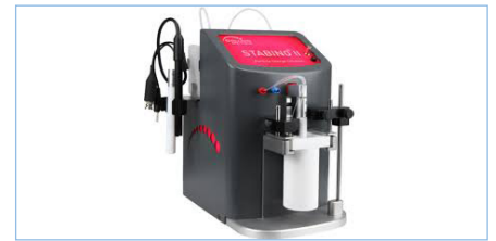
Colloidal Stability Testing