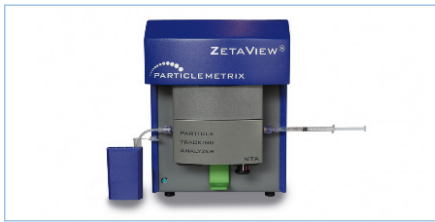
Nanoparticle Tracking Analysis