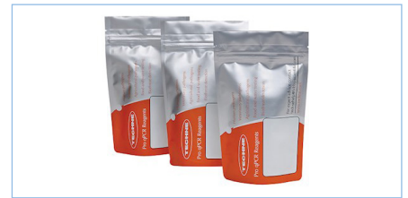
Pathogen Detection Kits