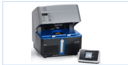
Thermal Cyclers and qPCR