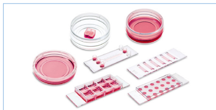
µ-Slides and µ-Dishes