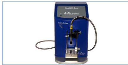
Dynamic Light Scattering